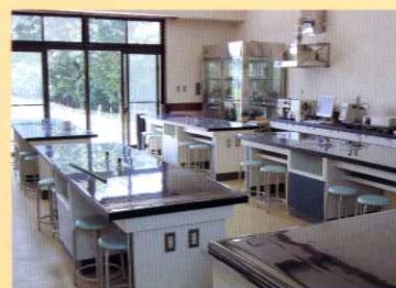
Practice/ Training Rooms A