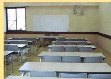
Practice/ Training Rooms B