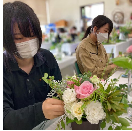
Floral Design Course